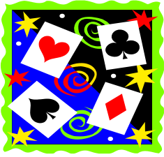
Table Talk A newsletter from Taupo Contract Bridge Club – June 2012