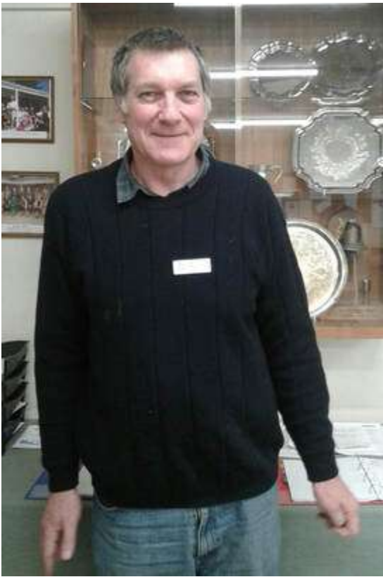
You Travel Mid Winter Bridge and Dinner