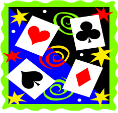
Table Talk A newsletter from the Taupo Contract Bridge Club –May 2015