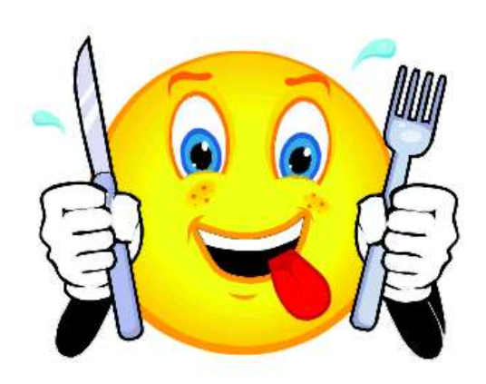
Bridge session will start at 7pm

This is always a very interesting and enjoyable evening's bridge where we can pit our skills against all the other clubs in NZ, all playing a set of hands for which we are given a booklet analyzing the bidding and the play at the end of the evening. $10 entry. POTLUCK MEAL – 6PM (cash bar will be open) – PLEASE BRING A PLATE